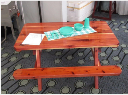
Silent Auction Child's Picnic Table