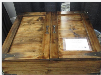
Live Auction Coffee Table