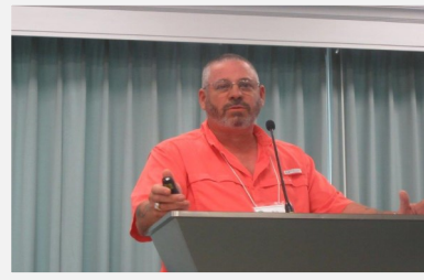
TEAM Safe Trucking President