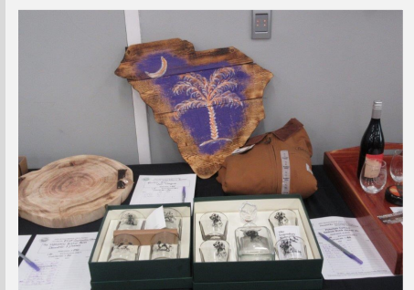
Silent Auction Items