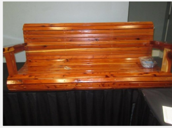
Live Auction Cedar Swing