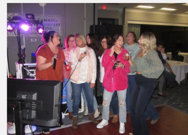
Fun Time Choir