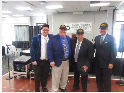
Port City Quartet