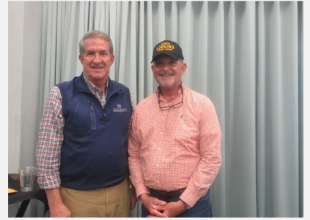
Crad and the "Commissioner"