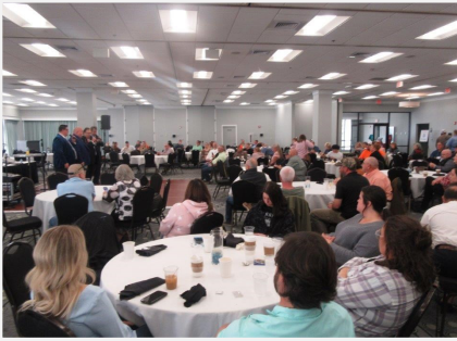
Sunday Prayer Breakfast