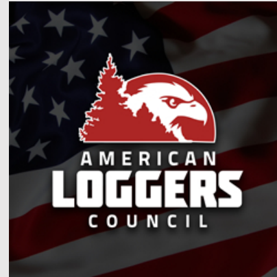
Loggers Working for Loggers

This is an historic accomplishment. For the first time ever in our long history of forest management, the timber industry will be recognized as an agricultural commodity like other agricultural sectors.