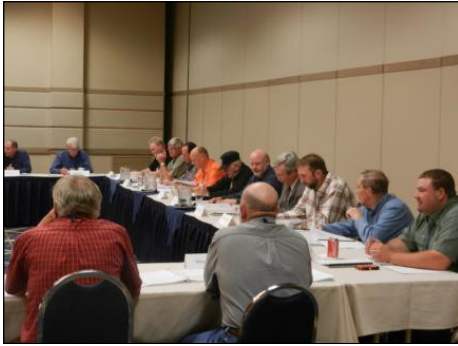
ALC Board of Directors Meeting