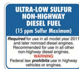
EPA 40 CFR 80.572(b) and 80.573(a)