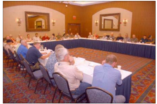
ALC Board of Directors Meeting