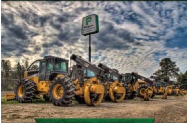
C SERIES SKIDDER