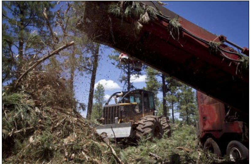
Workers in high-tech heavy machines perform today's logging in Arizona. Gone are the spiked boots for climbing trees and such tools as the chain saw, the crosscut saw, the ax and the hatchet.