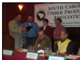
Logger Activist Award Winner