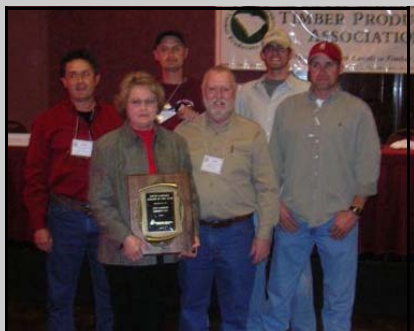
Leo Lambert Logging, Inc.