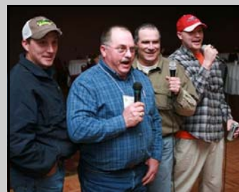
Ideal Logging Singers