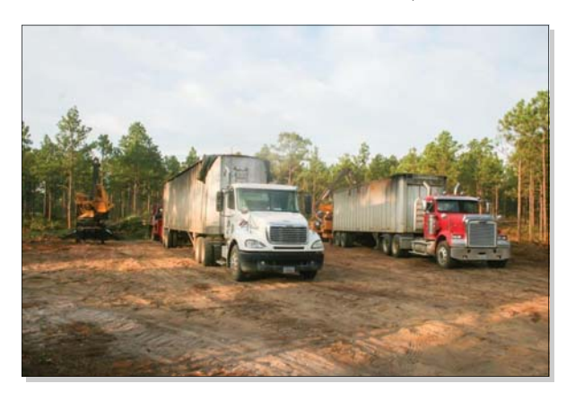
Beech Island trucks on deck.

ber & Construction voluntarily worked to clear downed trees and debris from roads and properties the night of the tornado in Beech Island. For their work, Josh was