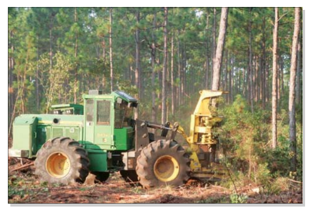
Beech Island - JD Feller Buncher