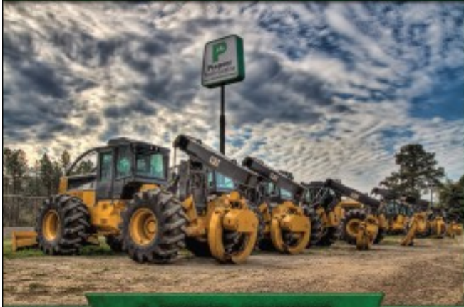
C SERIES SKIDDER