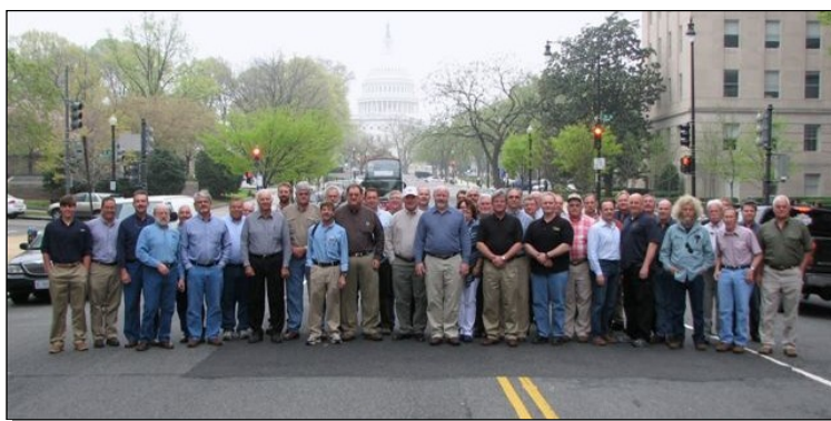
ALC Board members and guests in Washington, D.C.