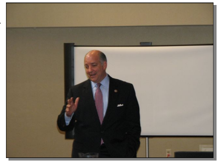
Congressman Steve Southerland

plained the need to utilize woody biomass in a future renewable energy economy. Congressman Southerland announced that he would be supporting and co-sponsoring the Silviculture Regulatory Consistency Act, HR 2541 that would make permanent the silviculture exemptions from NPDES permits and discussed other measures that the House had taken up in an attempt to ease the regulatory burdens on the industry.