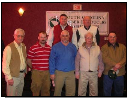
Past, present and new board members.