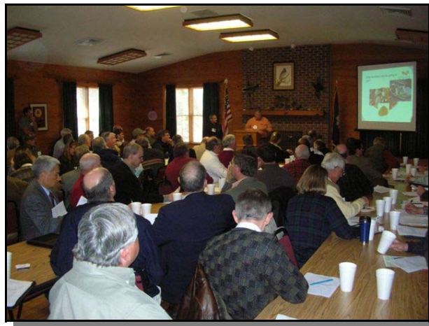
SC Biomass Council March Meeting in Columbia.

An RES is a standard that is meant to increase renewable electricity production by