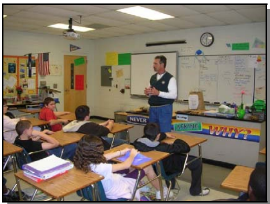
Crad talks sustainable forestry at Aiken Middle School