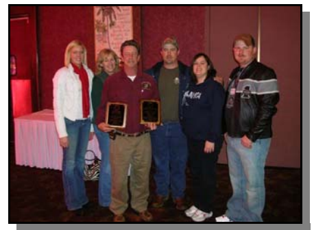
Logger Activist winner Arledge Logging & Timber