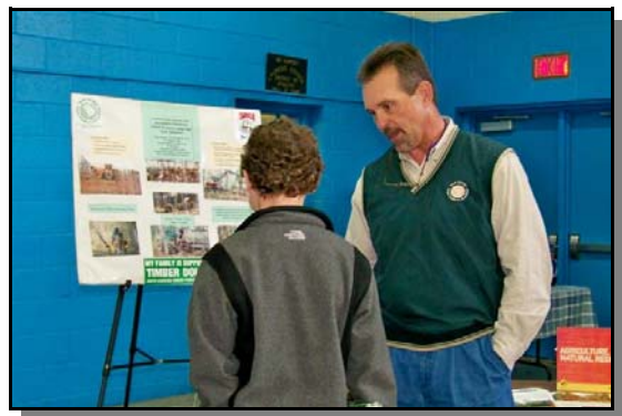
Career Day at Laurens Middle School